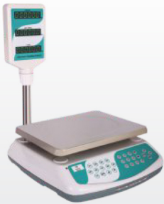
PRICE COMPUTING SCALE