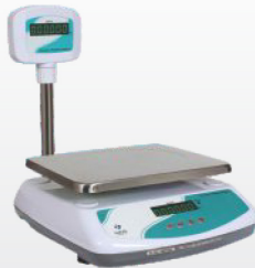
TABLE TOP SCALE